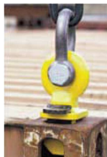
Container lifting lug CLT