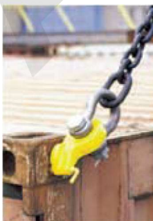
Container lifting lug CLB